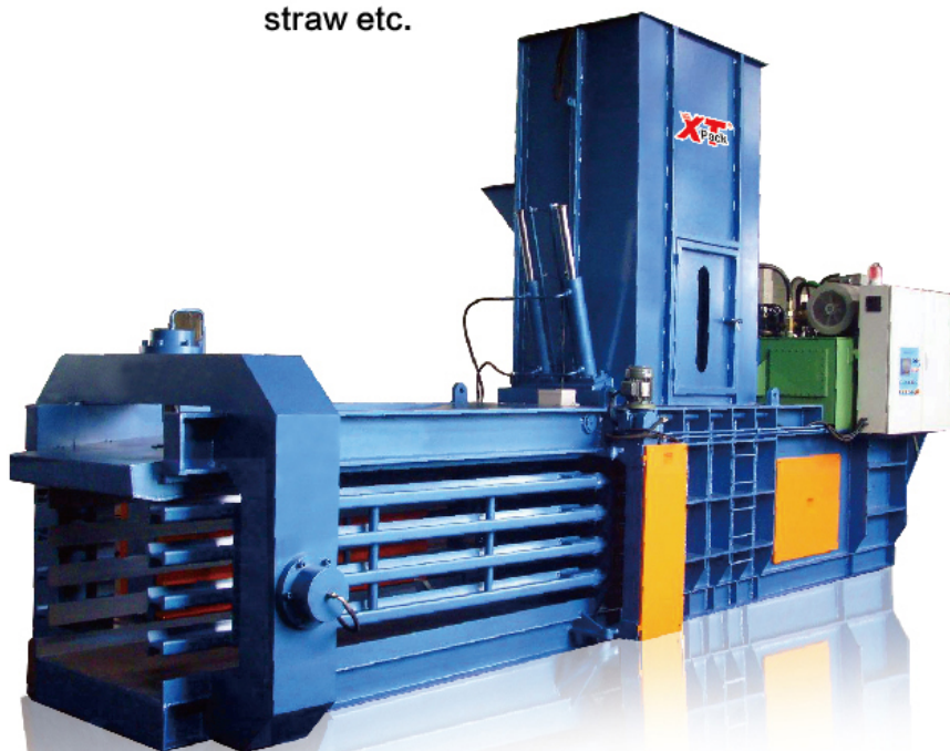
Diagram (Model XTY-1000W110110-60)