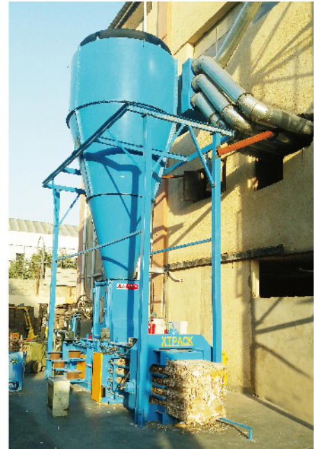
瓦楞纸箱行业整厂废纸处理系统示意图 The Diagram of Packaging Waste Management Systems

Specially used for recycling waste paper, cartons/cardboards trims/scraps etc. which are popular in packaging/ corrugation industrial, paper/ printing plants etc.