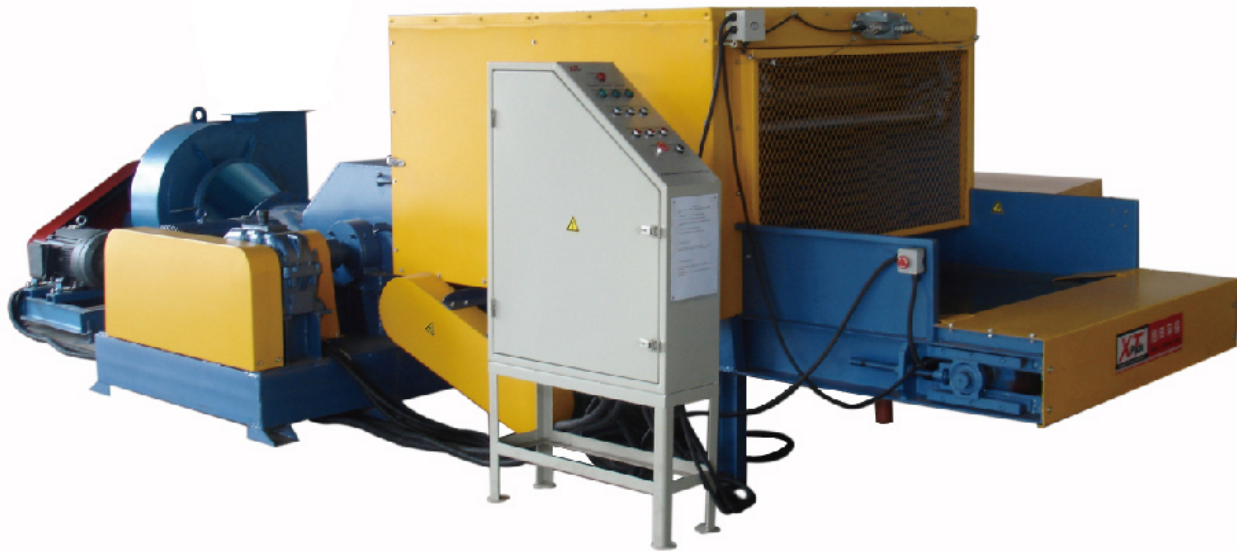
Diagram (Model XPS-1450)

Specially used for shredding waste paper, cardboard or carton.