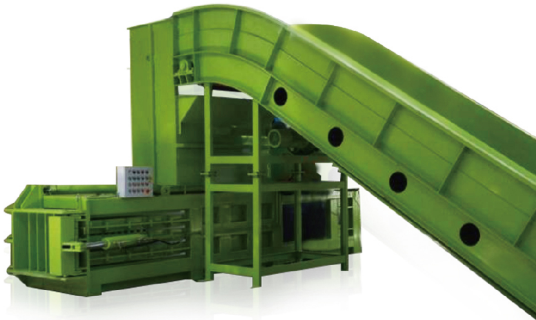
Bale Size (Model XTY-1000WB11085)

Specialized in recycling and compressing the loose materials like plastic film, PET bottles, plastic pallets, waste computer shell, waste paper, cartons, cardboards trims/scraps, foam etc.